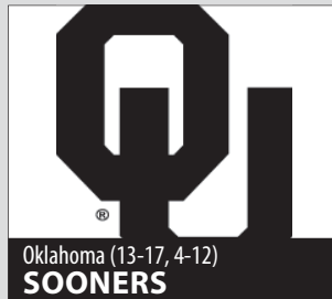
Oklahoma (13-17, 4-12) SOONERS