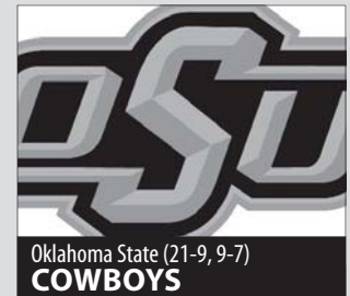
Oklahoma State (21-9, 9-7) COWBOYS

Date ..... Wednesday, March 10 Tip Time ..... 6 p.m. CST Radio ..... KOKC AM 1520 in OKC; ..... KTBY AM 1430 in Tulsa; TV ..... KOCB Ch. 34 in OKC; ..... KJRH Ch. 2 in Tulsa; ESPN Full Court Webcast..... ESPN360.com Series..... Oklahoma leads 126-91